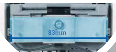
Paper Channel with tension unit