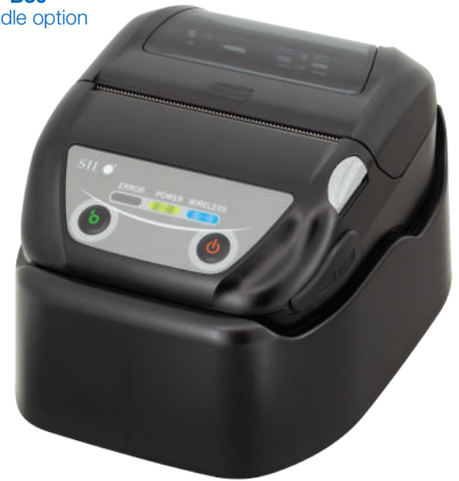
MP-B30 Cradle option