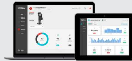
Lane/3000 is supported by our Cloud Services