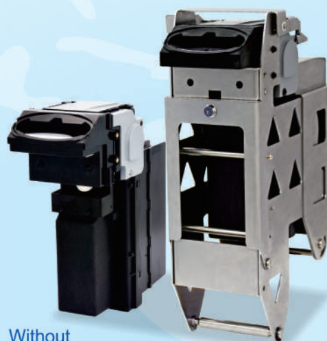
Without metal bracket L70T-P5/ L77T-P5